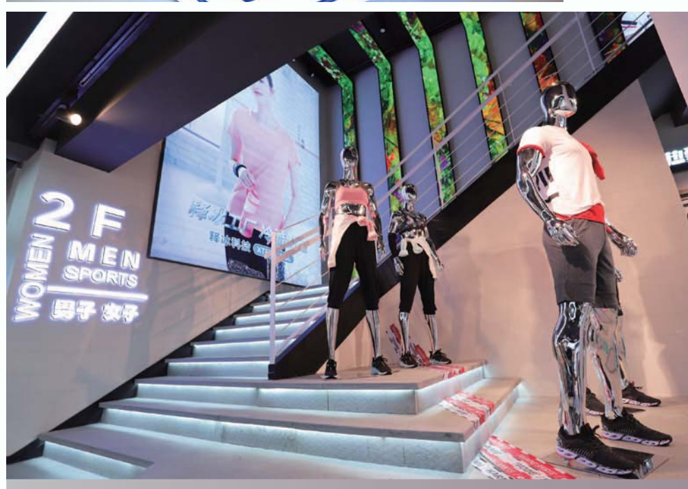
Anging, Anhui province, Mainland China