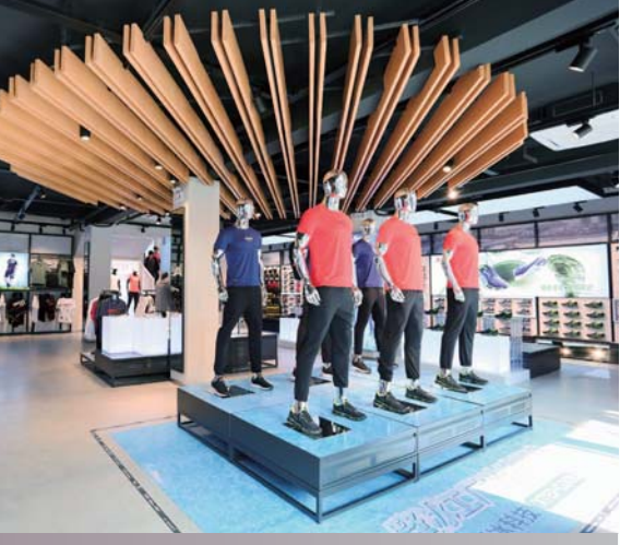
Shuozhou, Shanxi province, Mainland China